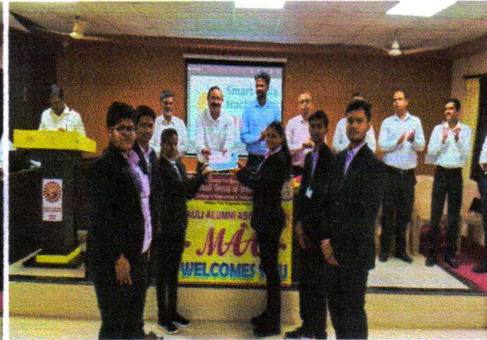
Prize Distribution Rs 500 to Third Winner