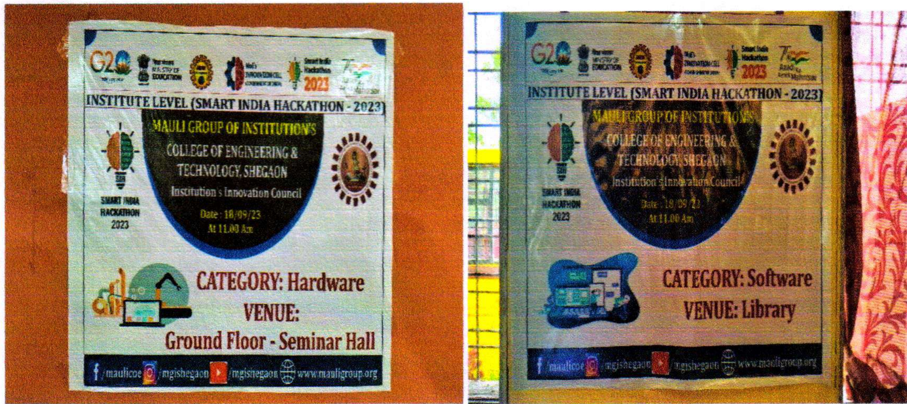
Venues for Hardware & Software