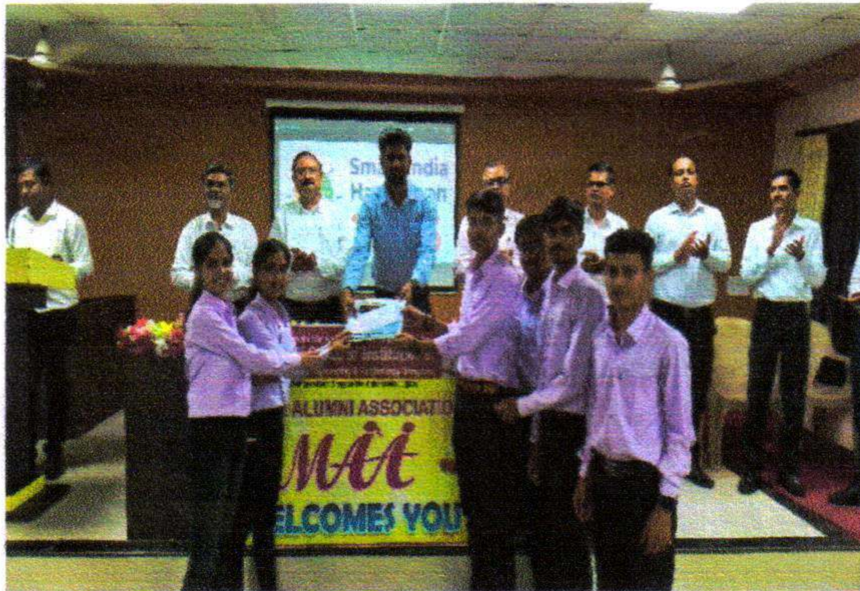
Prize Distribution Rs 500 to Third Winner