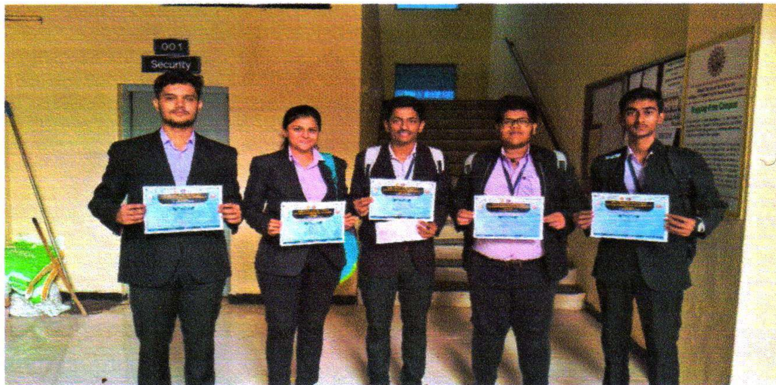
Students with Certificate

All Photo and Video: https://drive.google.com/drive/folders/19pj9J1-x7dZl-wjEsCJSq0Uf9fOxAqbf?usp=drive_link