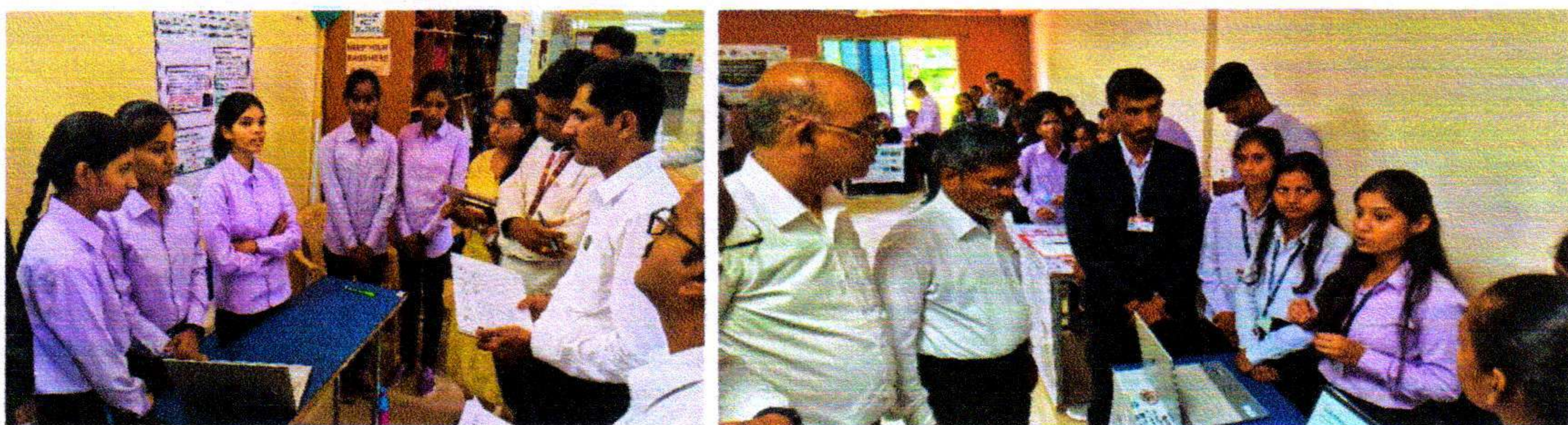
Evaluation by Juries