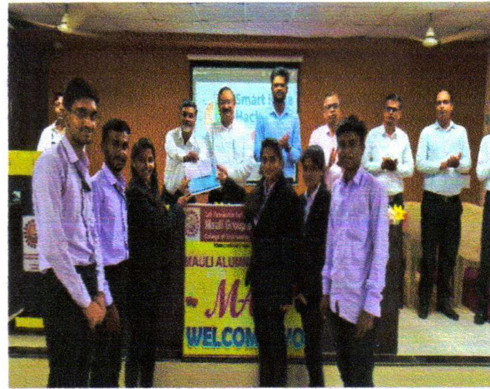
Prize Distribution Rs 1100 to Second Winner