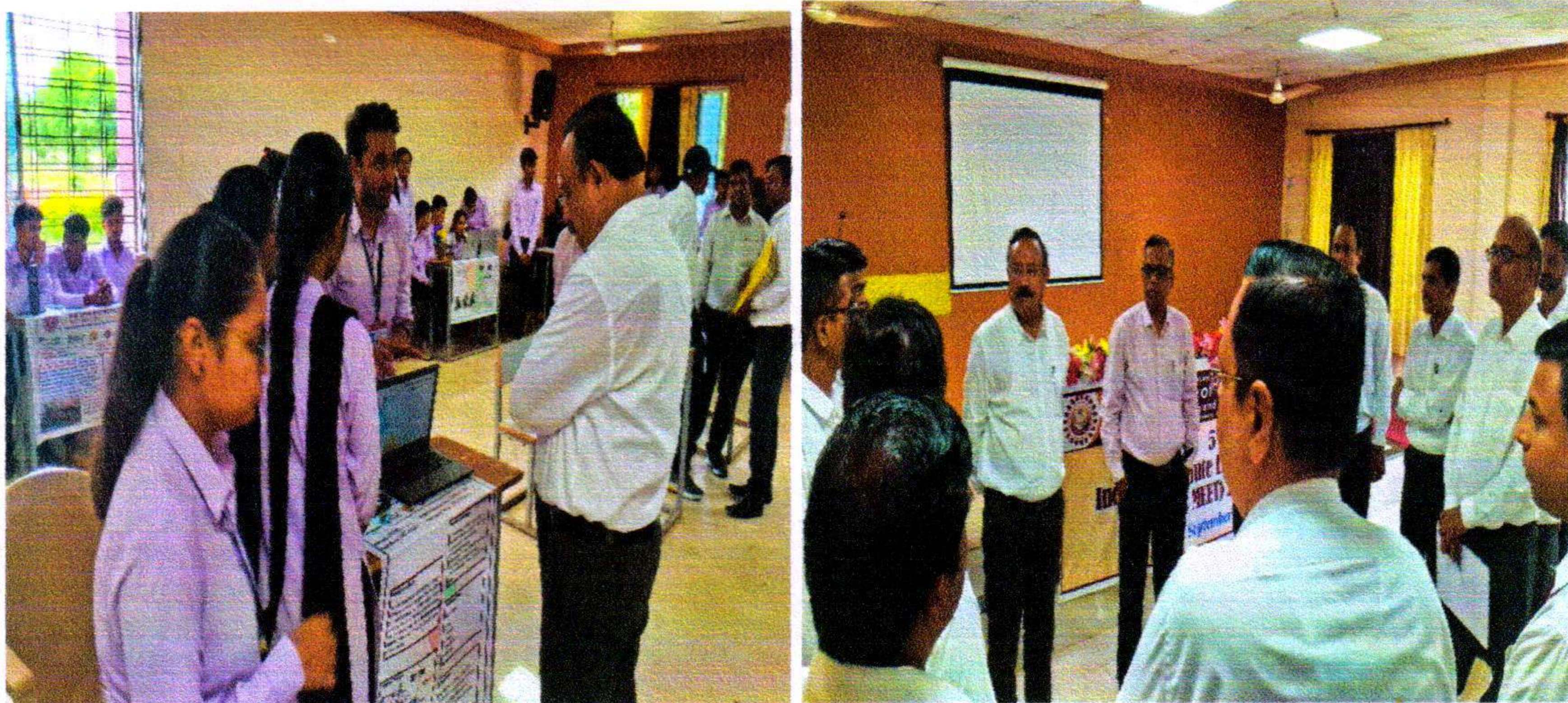
Respected Principal and Head of Department with Juries.