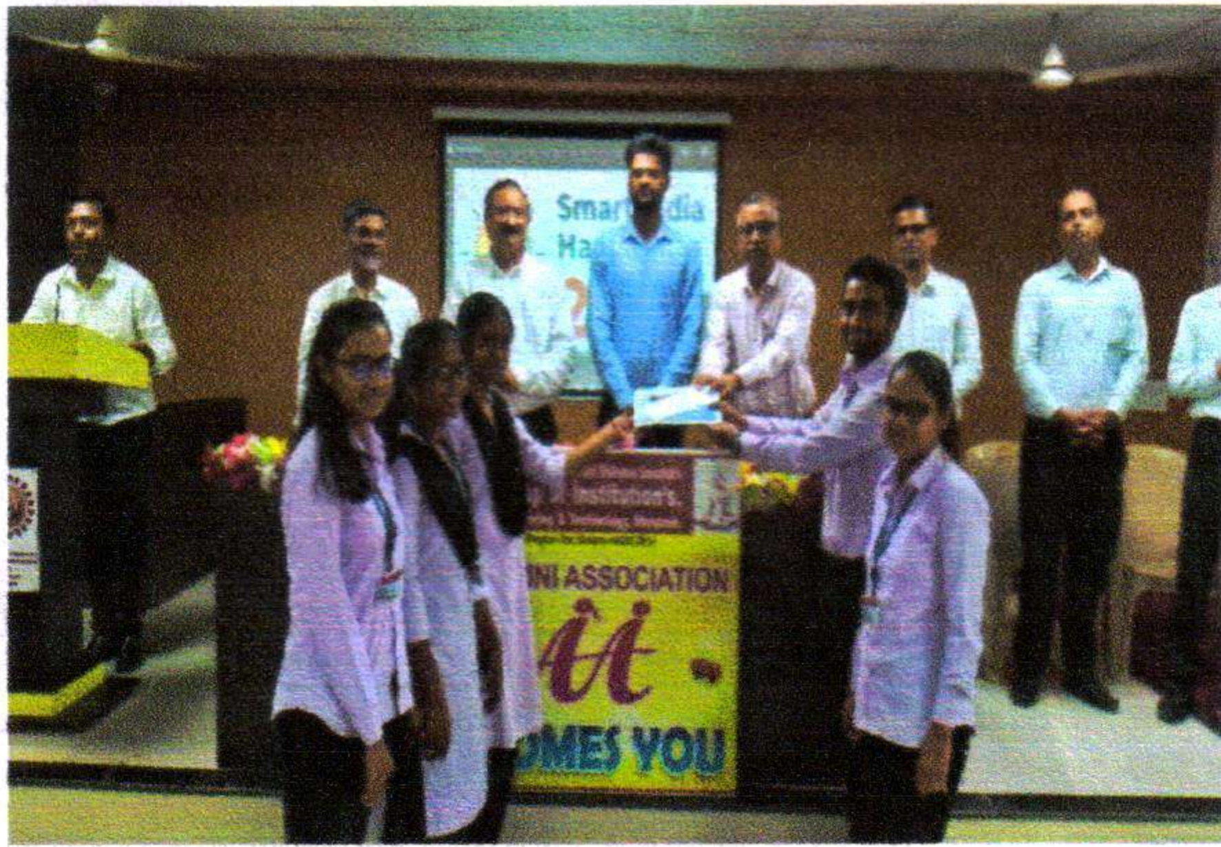
Prize Distribution Rs 2100 to First Winner